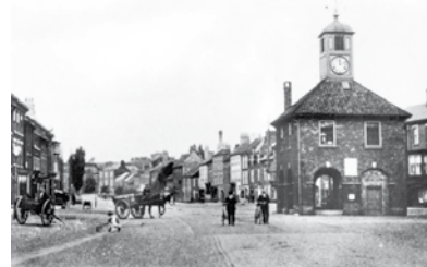
Yarm High Street

In the eighteenth century, in the period of Wesley's visits, the town was thriving. Trades included rope makers, brewers, tanners, nailers, clockmakers and shipbuilders. Vessels of up to sixty tons traded with London and the Continent and Yarm attracted trade goods from a wide area, including lead brought by pack horse from Swaledale and Teesdale.