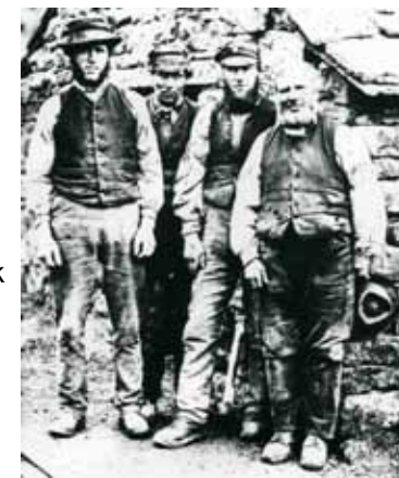
North Pennine lead miners

The dales were bursting at the seams with scores of mines and thousands of miners and their families – a boisterous, energetic and young population hungry for work and dreaming of wealth. Reality for most was a life cut short by lung disease and a constant struggle to make ends meet. A miner's life was a hard one, as you can discover at Killhope Lead Mining Museum.